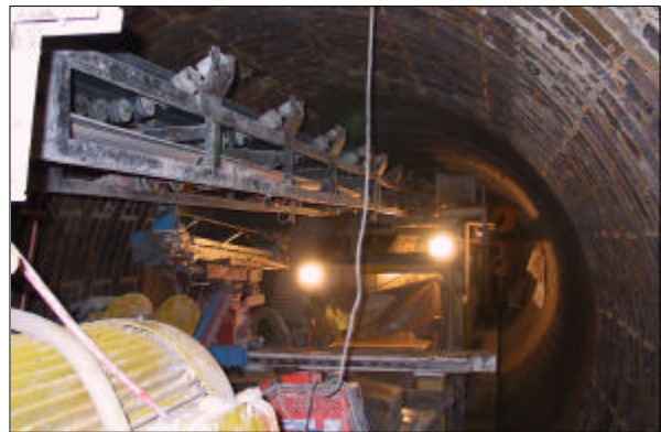
TBM excavation with steel panel installation (undercut of Landikon railway tunnel)